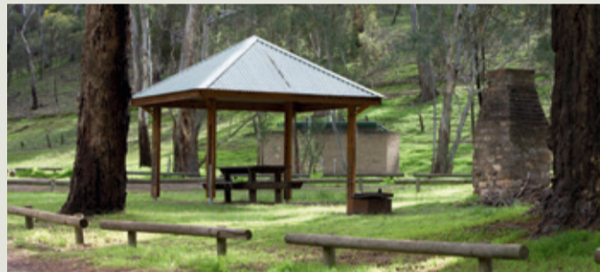
Wirrabara Forest Picnic Ground

Visitors may collect wood for campfires from the plantation forest floor only, near their campsites and picnic areas. It is an offence to cut down or damage standing trees or plants. Campfires are restricted to designated fire places located in campgrounds, picnic areas and at huts. Please conserve wood supplies by keeping fires small.