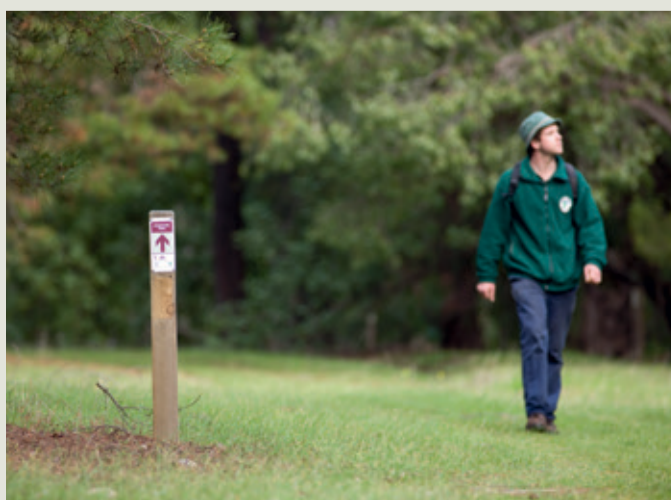
Walking along the Ippinitchie Trail

For more information regarding the extensive trail network within Wirrabara Forest Reserve, please refer to the map or contact the Wirrabara Forest Office.