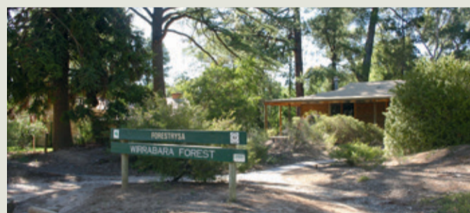
Wirrabara Forest Office