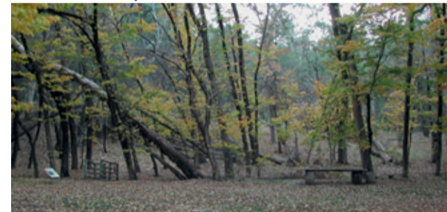
Old Wirrabara Nursery

Located 2 km driving distance west of the Wirrabara Forest Office. The nursery contains many fine examples of trees originally planted in 1877 to determine their suitability for forestry in South Australia. The area contains picnic tables.